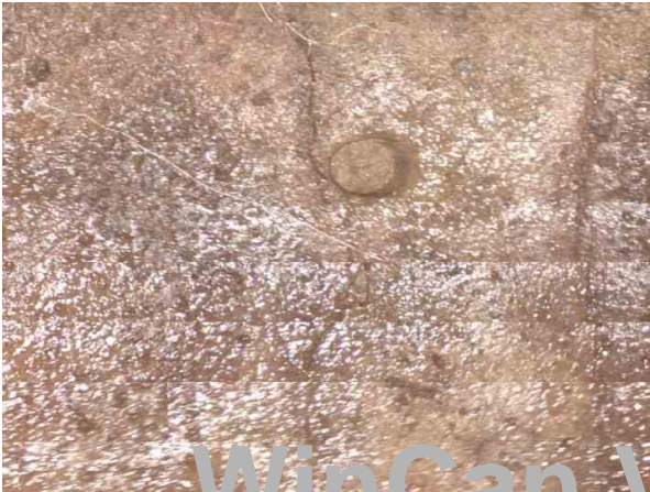
1, , 0.47 Ladder support missing (Ladder clip missing).