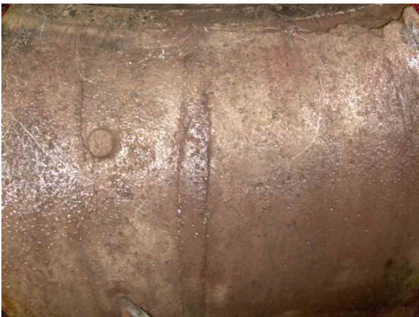
3, , 3.19 Ladder support missing (Ladder clip missing).