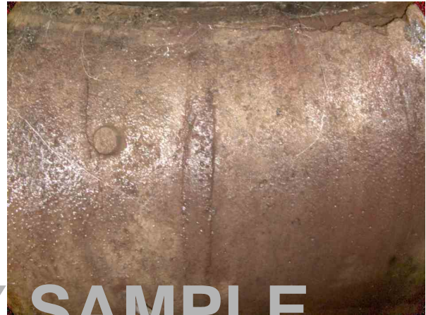
2, , 0.47 Ladder support missing (Ladder clip missing).