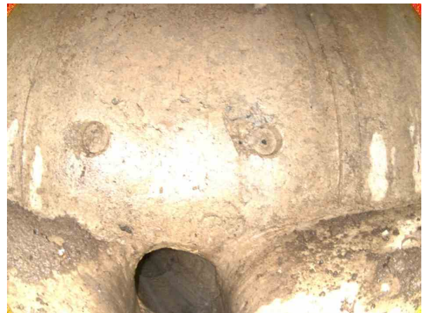
4, , 3.49 A conduit connecting to the maintenance structure, circular, incoming. at 1 o'clock