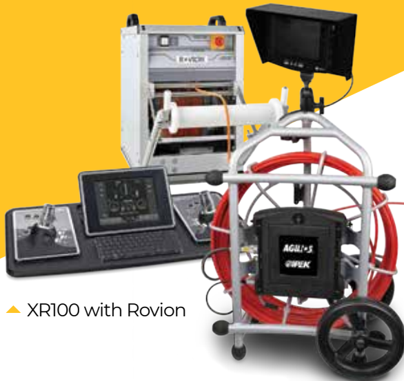
▲ XR100 with Rovion

✓ Range of application from DN50 to DN300