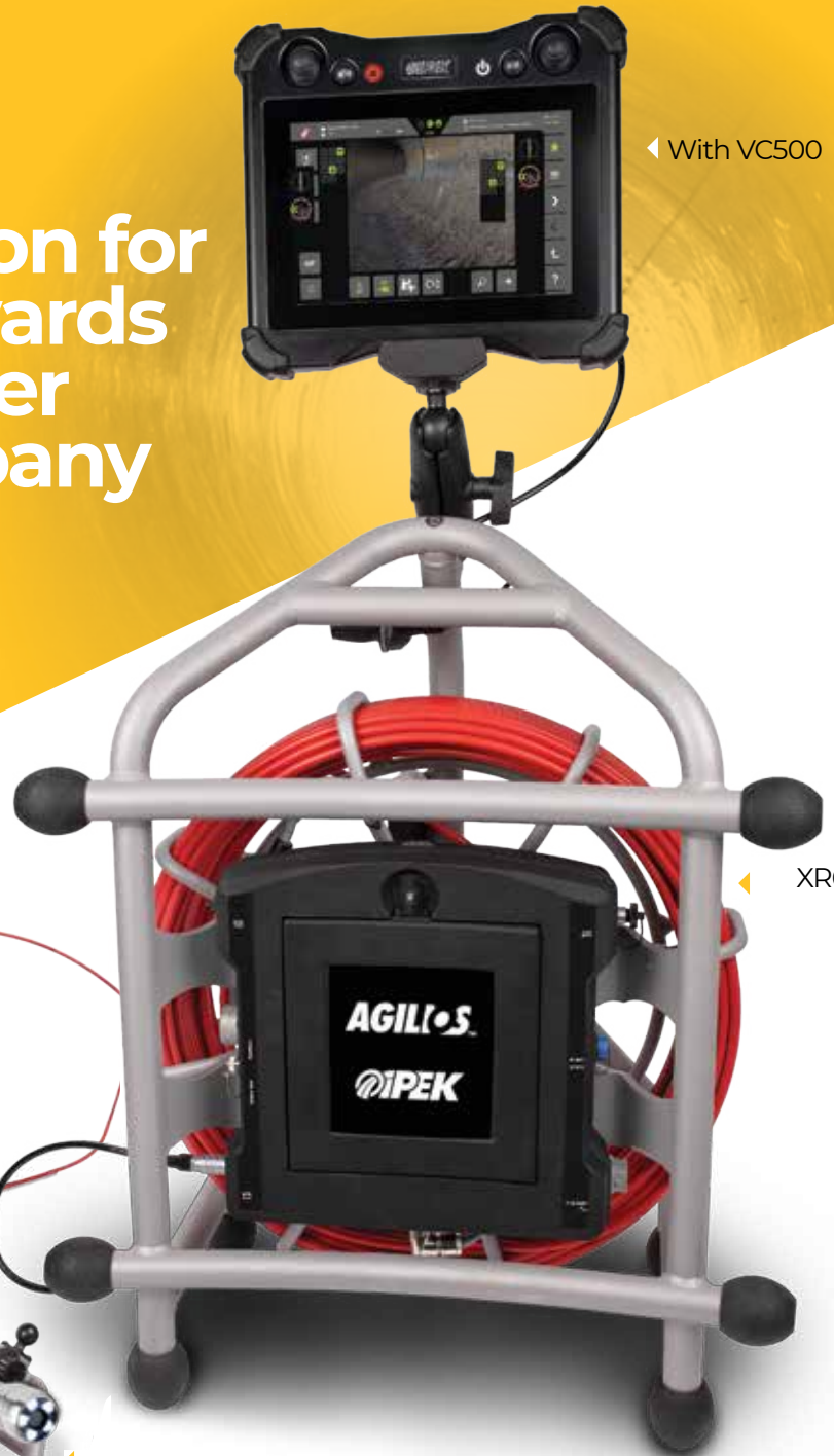
◀ With VC500