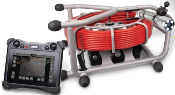
◀ XR60 with VC500 *on side