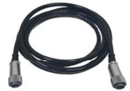
Optional 3m Link Cable