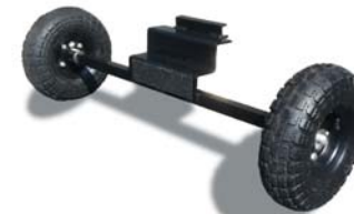
Optional All Terrain Wheels