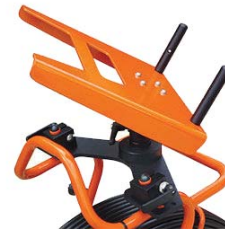
Optional Tilt Table