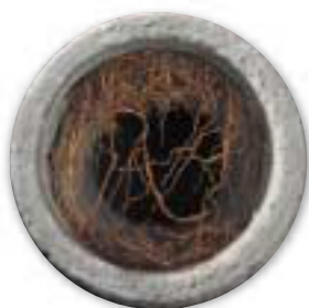
Without RootX, roots begin vigorous regrowth into the newly cleared space.