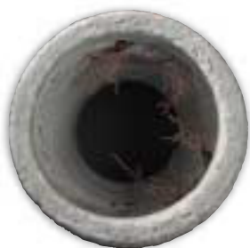
With RootX, debris is decaying and roots are stunted.