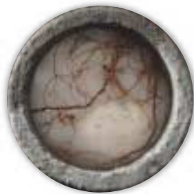
Step 2 - Add RootX. Foam kills remaining roots and inhibits future regrowth.