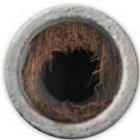
Step 1 - Mechanical cutting of roots clears roots from pipe, leaving some behind.